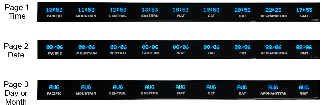
Model 561I - 1.2" 5 character dot matrix time, date, day, 0.75" zone labels, 9 zones